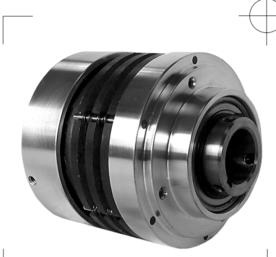
LSCB-44 High Torque Model